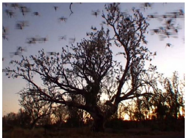
Still Waiting, 2005