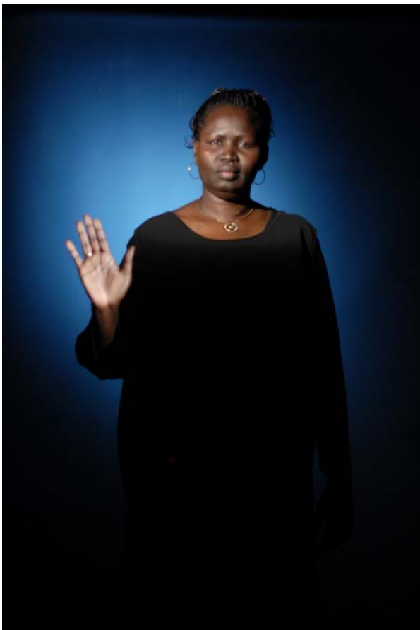
Evolution of Fearlessness, 2006