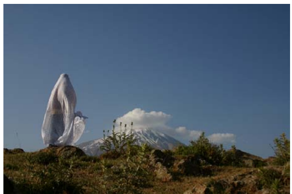
Damavand Mountain, 2006